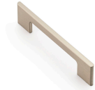
Dull Brushed Nickel